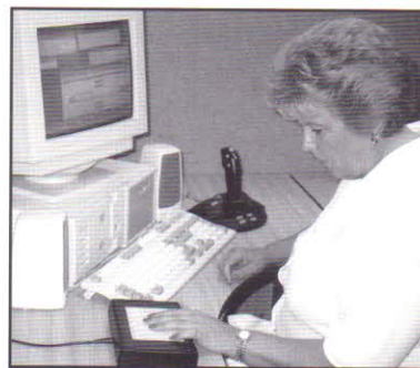
Access to hypermedia systems will be of increasing importance to all users including those with disabilities.